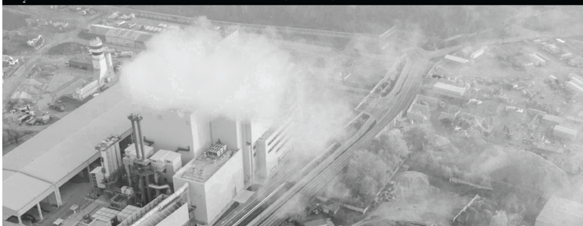
CO 2 EMISSIONS BEING RELEASED INTO THE ATMOSPHERE, POZNAŃ, POLAND.