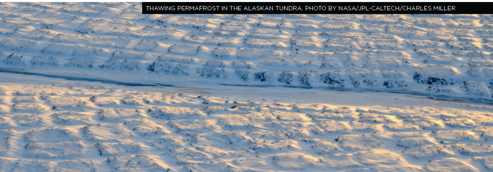
THAWING PERMAFROST IN THE ALASKAN TUNDRA.