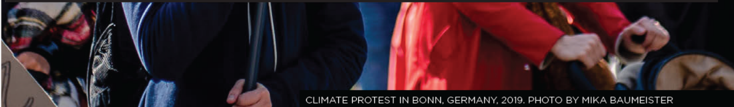
CLIMATE PROTEST IN BONN, GERMANY, 2019.