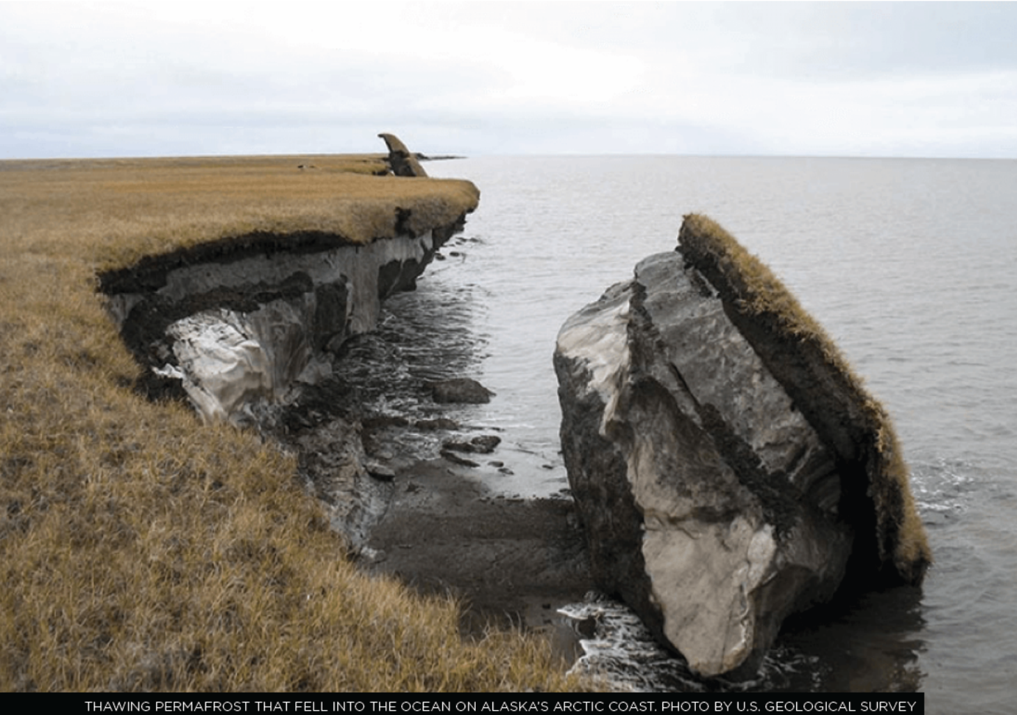
THAWING PERMAFROST THAT FELL INTO THE OCEAN ON ALASKA'S ARCTIC COAST.