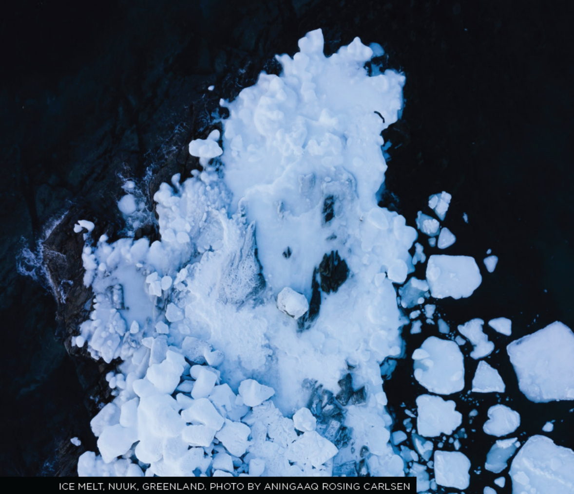
ICE MELT, NUUK, GREENLAND.

The IPCC 6th Assessment Report (AR6) is the most important assessment of humanity's future on Earth to date. CCAG commends the IPCC and all the scientists involved for their clear and unflinching assessment of the catastrophe we face without immediate action.