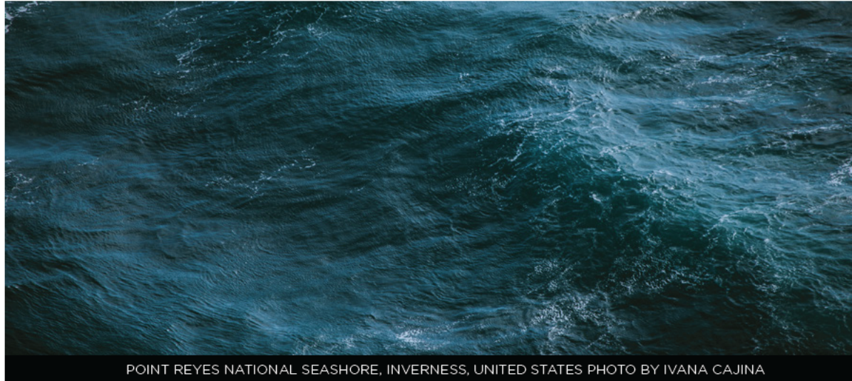
POINT REYES NATIONAL SEASHORE, INVERNESS, UNITED STATES

11 Tubiello, F., Rosenzweig, C., Conchedda, G., Karl, K., Gütschow, J., Xueyao, P., & Sandalow, D. (2021). Greenhouse gas emissions from food systems: building the evidence base. Environmental Research Letters , 16(6), 065007.